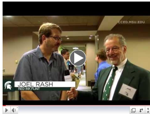
Recap of last year's Summit.